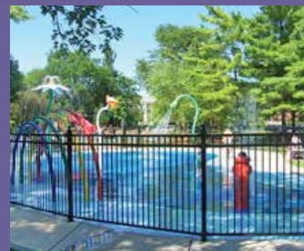
Oakbrook Terrace Park District Splash Pad